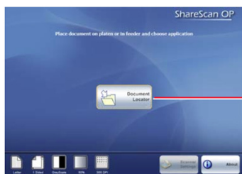
Document Locator Connector button Integrated on the ShareScan OP touch screen

Incorporate paper documents into your electronic document workflows to increase efficiency, reduce storage costs, and comply with regulations. The eCopy interface is ideal for scanning documents on-demand as they are received. Using a straightforward eCopy interface connected to the MFP (multi-functional printer), you can easily scan and route documents directly to Document Locator repositories. The Connector presents a Document Locator interface directly on the MFP or eCopy touch screen: